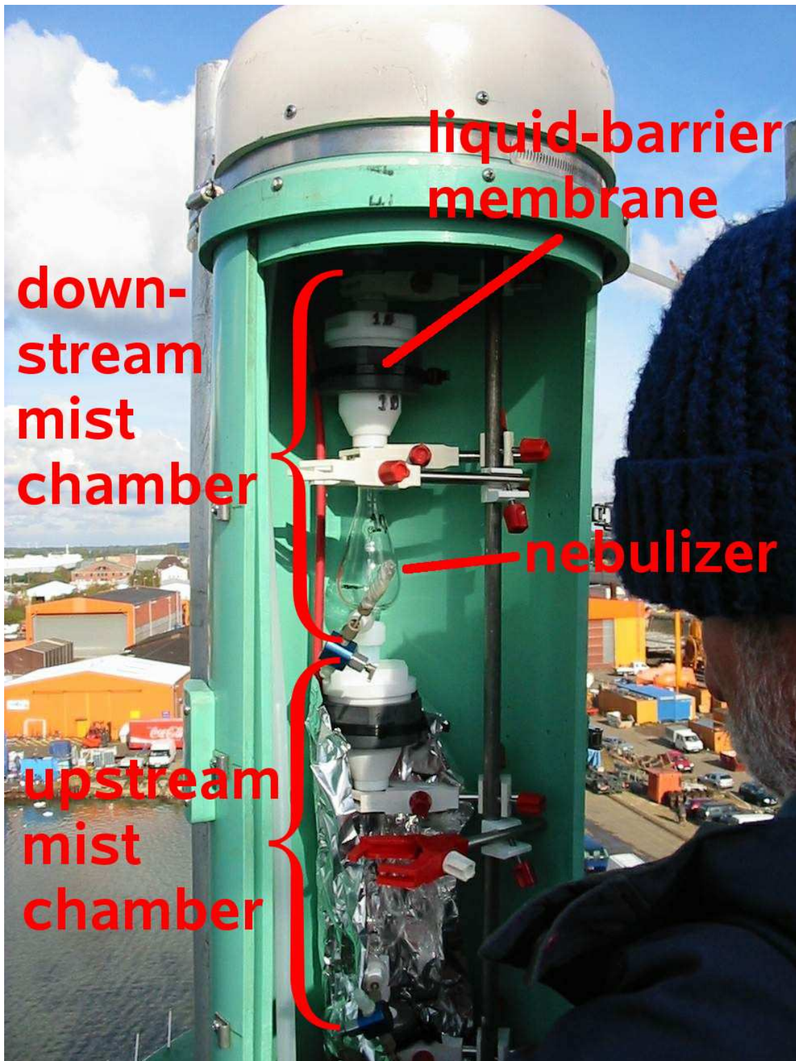
Figure S1c. Tandem mist chamber samplers mounted within housing.